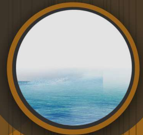
RIVER CLEAN-UP DRIVE