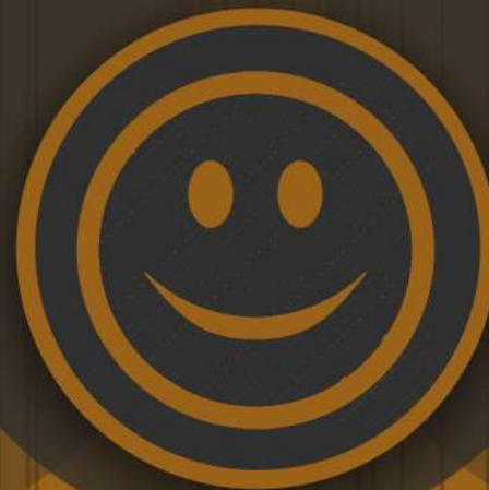
Project GIVE A SMILE